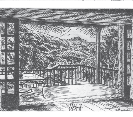
1948 Kūali'i Dining Lanai (Huc Luquiens)