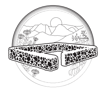
MĀNOA HERITAGE CENTER 2856 O'ahu Avenue, Honolulu, HI 96822