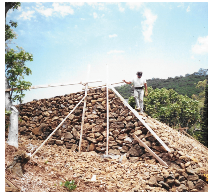
Kūka'ō'ō Heiau, estimated 500-800 years old, is restored in 1994, two years before MV is incorporated.