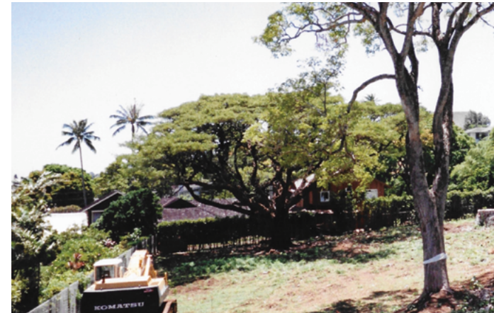
The future site of the MHC Visitor Education Hale 1993