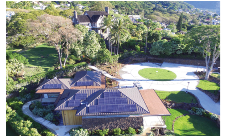
The Visitor Education Hale opened in 2018 making it possible to expand MHC's school and public programs.