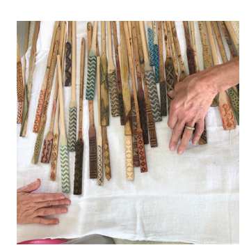
Ma Ka Hana Kaʻlke Kapa workshop participants choose an 'ohe kāpala to create a stamped design.

For more information about upcoming programs, sign up for MHC's monthly e-newsletter at www.manoaheritagecenter.org.