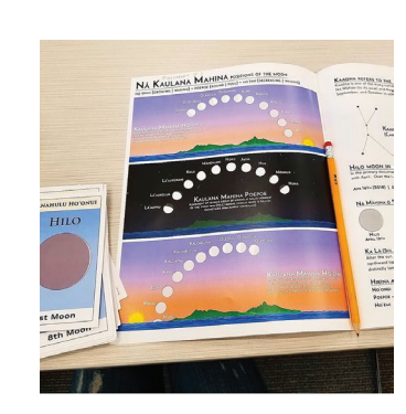
Nā Kaulana Mahina Workshops:

"Beginning a new cycle of Hawaiian Moon Class... Experiencing and participating in the rhythm of time and place. This scientific approach to environmental stewardship includes a holistic view of life. #hilomoon #kaulanamahina #hawaiianmoon"