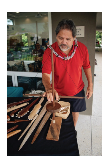
Above: The before and after stages of making a niho 'oki shark's tooth utility knife.