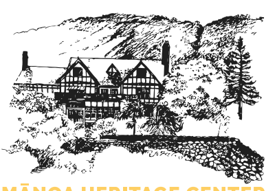
MĀNOA HERITAGE CENTER 2856 Oʻahu Avenue, Honolulu, HI 96822